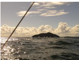
Sailing off Cabbage Tree Island

The Performance Cruising races also have two divisions with Kayimai in Division one and Rumba, Macscap, Azlan, Lu Lu Belle and Caviar in division two. These races were off shore so we got to sail around the islands lying off the entrance to Port Stephens. On the first day the wind petered out just as we were entering the heads. As the IRC boats passed we did try for a tow but to no avail. Day two saw better winds and a very pleasant sail around Cabbage Tree Island and back.