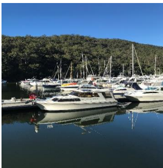
As first seen

You may have noticed the absence of a name for my new boat. All will be revealed in due course. We look forward to many happy days on board with maybe not so many people as before but she has a capacity of 8 Adults.