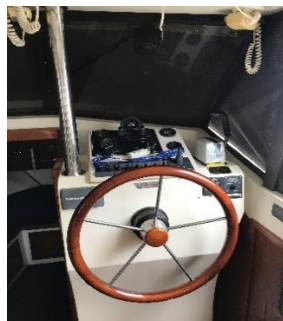
Helm and controls